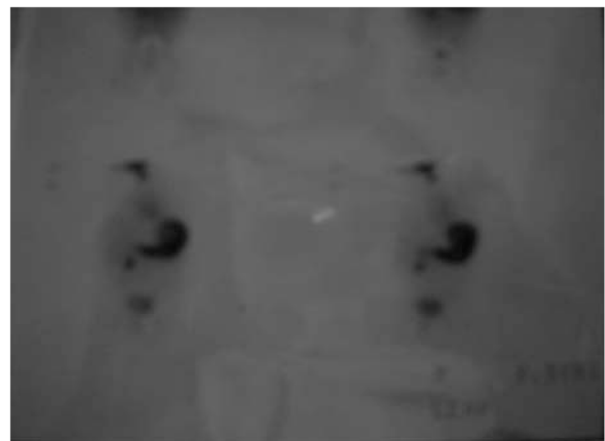
Figure 2. Meckel's scan showing concentration of radiopharmaceutical in the Right iliac fossa and in the urinary bladder. A case of bleeding Meckel's diverticulum with ectopic gastric mucosa

Investigations which contributed to preoperative diagnosis were a) plain x-ray examination of abdomen (diagnosed intestinal obstruction / pneumoperitoneum) b) fistulogram (identified patent vitellointestinal duct) c) Meckel's scan using technetium 99m pertechnetate to diagnose Meckel's diverticulum (figure 2) d) sigmoidoscopy in cases of lower G.I.bleeding.