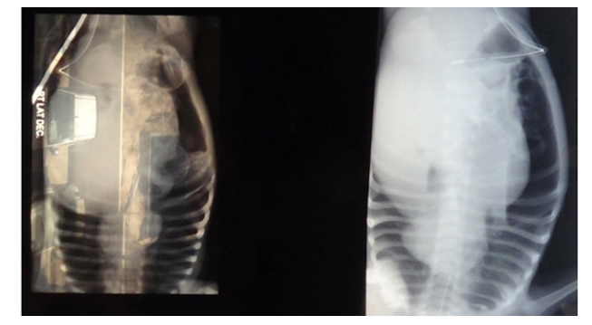
Figure 2. Case I, Lateral decubitus radiographs showing marked reduction of pneumoperitoneum on day2

hospital. He was admitted there on the same day with pneumonia; he developed distended abdomen, swollen scrotum, anaemia and lethargy. He was taking feeds and passing stools as normal at home. He was put on mechanical ventilation due to very poor breathingeffort. On examination, he was inactive, flabby, and blood pressure was unrecordable. Abdomen was distended, tense with no bowel sounds. Digital rectal examination revealed empty rectum. Leucocyte count was 29x103/ml, platelet count was normal, C-reactive protein level was raised (96mg/l). Blood-gas analysis showed severe acidosis. Abdominal roentgenograms (supine and left lateral) (Figure 1) showed pneumoperitoneum and air-fluid level. On paracentesis, no free air but 300ml opalescent fluid was drained. As life-saving procedure, bed-side peritoneal drainage tube was inserted, which drained another 400ml. Child was kept on medical treatment including nil per oral, nasogastric aspiration, intravenous fluids, antibiotics