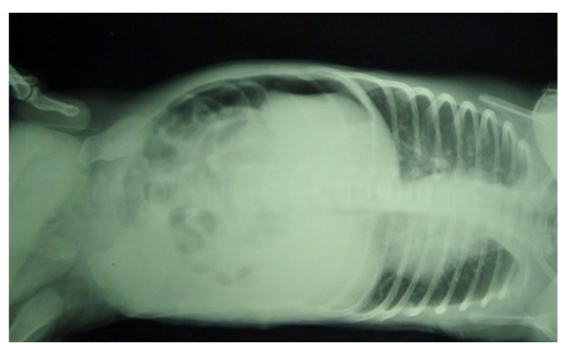
Figure 1. Case II, Erect and lateral decubitus radiographs showing pneumoperitoneum

Case II: 1 day old full-term male having low birthweight (2300g) was admitted in neonatology with asymptomatic polycythemia (at 6 hours of age, haemoglobin level was 24.6gm%, haematocrit was 70.6%). He underwent partial exchange transfusion. He was given feeding. Next day, he developed greenish vomiting and abdominal distension, but passed meconium. Examination showed sick-looking child. Abdomen was distended and tender, but without erythema. Nasogastric tube drained greenish fluid. Serum chemistry showed elevated levels of bilirubin, urea, creatinine, aspartate aminotransferase and, alkaline phosphatase and low protein levels. Abdominal roentgenograms showed pneumoperitoneum (figures 3&4). Emergency laparotomy was done. Moderate amount (about 50ml) of greenish fluid was found in peritoneal cavity. Stomach, small intestines including duodenum,