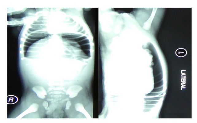
Figure 1. Case III, Erect and lateral decubitus radiographs showing pneumoperitoneum