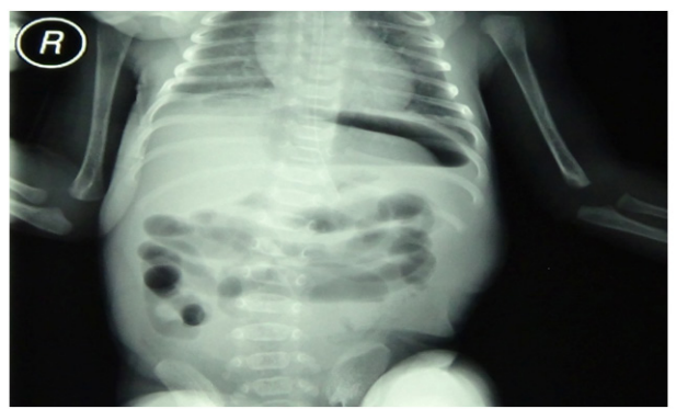
Figure 1. Case II, Erect and lateral decubitus radiographs showing pneumoperitoneum

and mechanical ventilation. Next day, neurosurgeon aspirated another 400ml of peritoneal fluid. He exteriorized the shunt tube from peritoneal cavity and connected to external drainage-bag. The fluid from shunt-tube was clear. Peritoneal fluid chemistry was suggestive of transudate; its cytology showed WBC count 700/ml; RBC count 1000/ml, but no organism including acid fast bacillus was seen and culture yielded no growth. Analysis of cerebrospinal fluid from the VP shunt was insignificant.