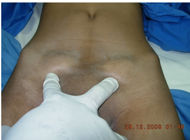
Figure 1. Bilaterally dislocated testes

An eighteen year old boy presented to the Urology outpatient department with absent testes in both the scrotum since a road traffic accident, he had suffered one month back. He had a high velocity motorcycle accident following which he had sustained fractures involving femur, radius, superior and inferior pubic rami. He was sure that both the testis was within the scrotum prior to the accident. Surgical correction of the fractures was done within two days of the accident.