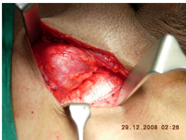
Figure 3. Testis seen in superficial inguinal pouch