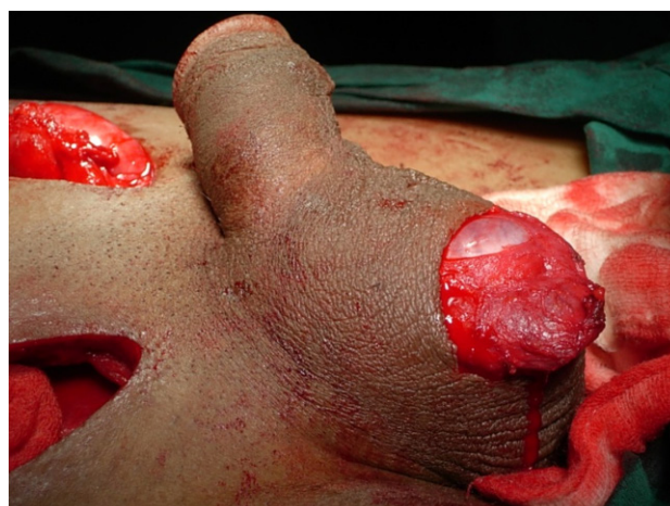
Figure 6. Testis being placed in subdartos pouch

Examination revealed two oval masses on either side in the inguinal region which were soft, immobile and tender. Scrotum was well developed on both sides and empty. Doppler USG showed that both the testicles were located subcutaneously in the inguinal region and were of normal size and vascularity.