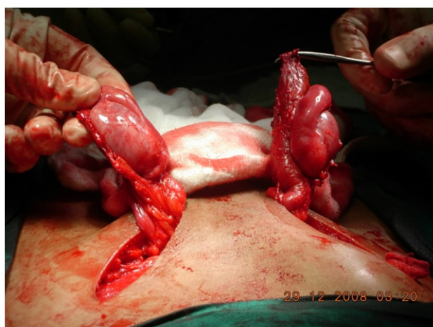
Figure 5. Both testes released