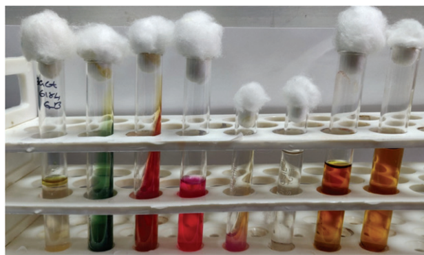
Figure 2. Biochemical reactions of Roseomonas gilardii

Roseomonas is a pink-pigmented, non-fermentative, oxidase positive, slow growing Gram-negative coccobacilli that has clinical importance as opportunistic bacteria which can lead to infections especially in immunosuppressed individuals. Most infections due to Roseomonas species are detected in patients with central venous catheters and underlying disorders. It is less reported in many hospitals