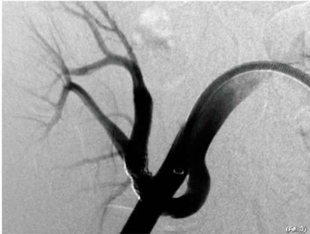
Figure 1. Angiogram showing narrow segment in post transplant renal artery

with 3 drugs (tacrolimus / MMF / steroids) with TAC levels at 2.3 mg% and 4.3 mg% on 7 th Nov. and 8 th Oct. respectively.