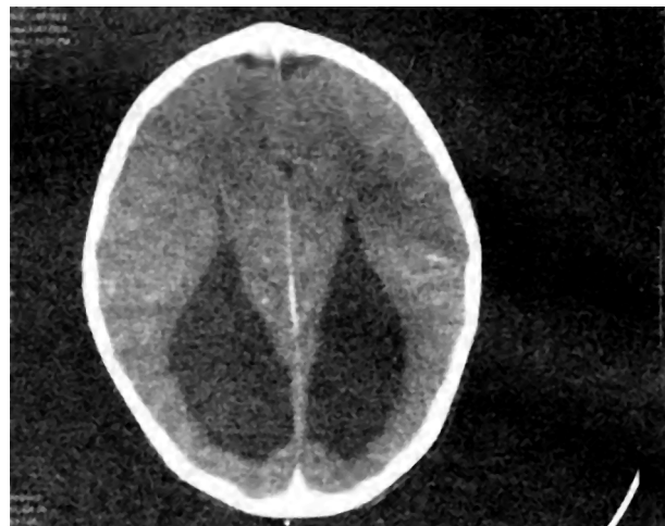
Figure 2. C.T. Head - Disproportionate enlargement of the occipital horns of the Lateral Ventricles. The Lateral ventricles. Highly placed 3rd Ventricle.