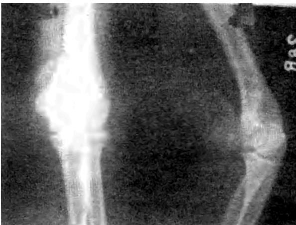
Figure 2. Unusual large anterior myositis 6 weeks