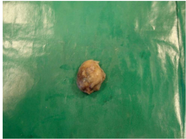
Figure 5. Gross view of the specimen

On follow up the patient was asymptomatic and within normal limits on urologic examination.