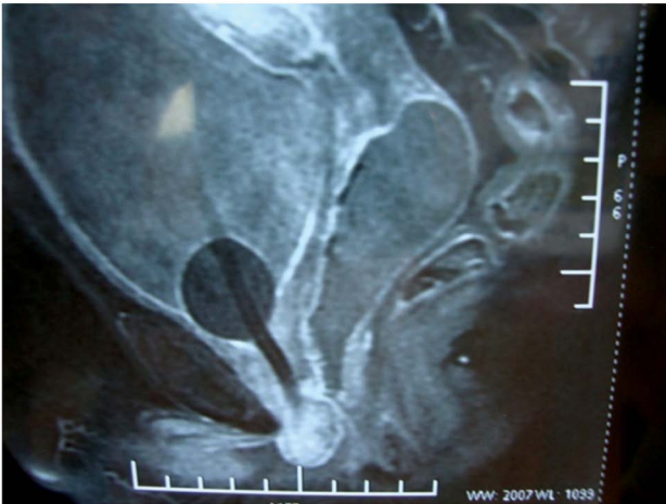
Figure 3. MRI Pelvis T2 weighted image STIR showing hyperintense image of tumour

Ultrasound examination (figure 2) of the pelvis done both in transabdominal and transvaginal modes showed the evidence of a soft tissue density polypoidal lesion of size 23x19 mm noted in the anterior vaginal wall with vascularity noted in the posterior urethral wall.