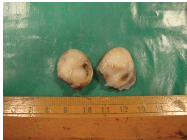
Figure 5. Cut section of the specimen showing tumour as solid encapsulated tissue