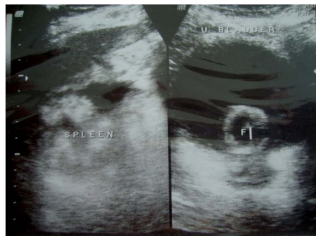
Figure 2. Ultrasound pelvis showing soft tissue density polypoidal lesion seen in anterior vaginal area arising from posterior urethral wall