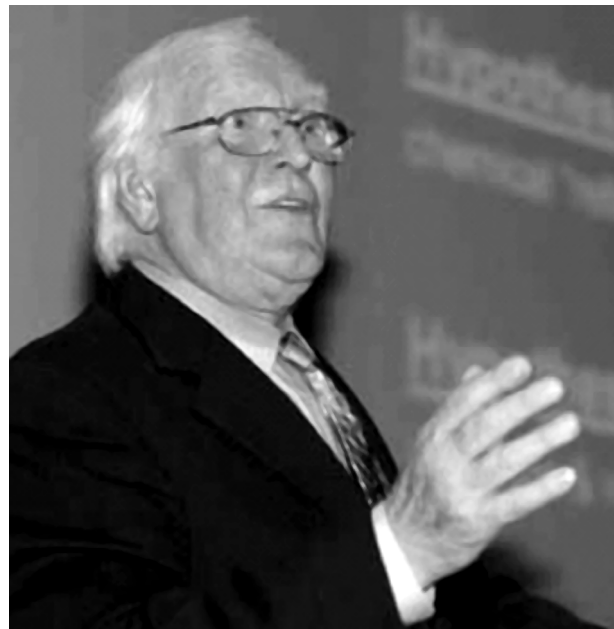
Figure 1. Sir James Whyte Black

Early studies in 1980s have shown that intravenous beta-blockers exhibited clinical benefits (ISIS1, MIAMI) 1,2 in STEMI. But data derived from large trials in the current era of reperfusion (TIMI IIb, GUSTO I and